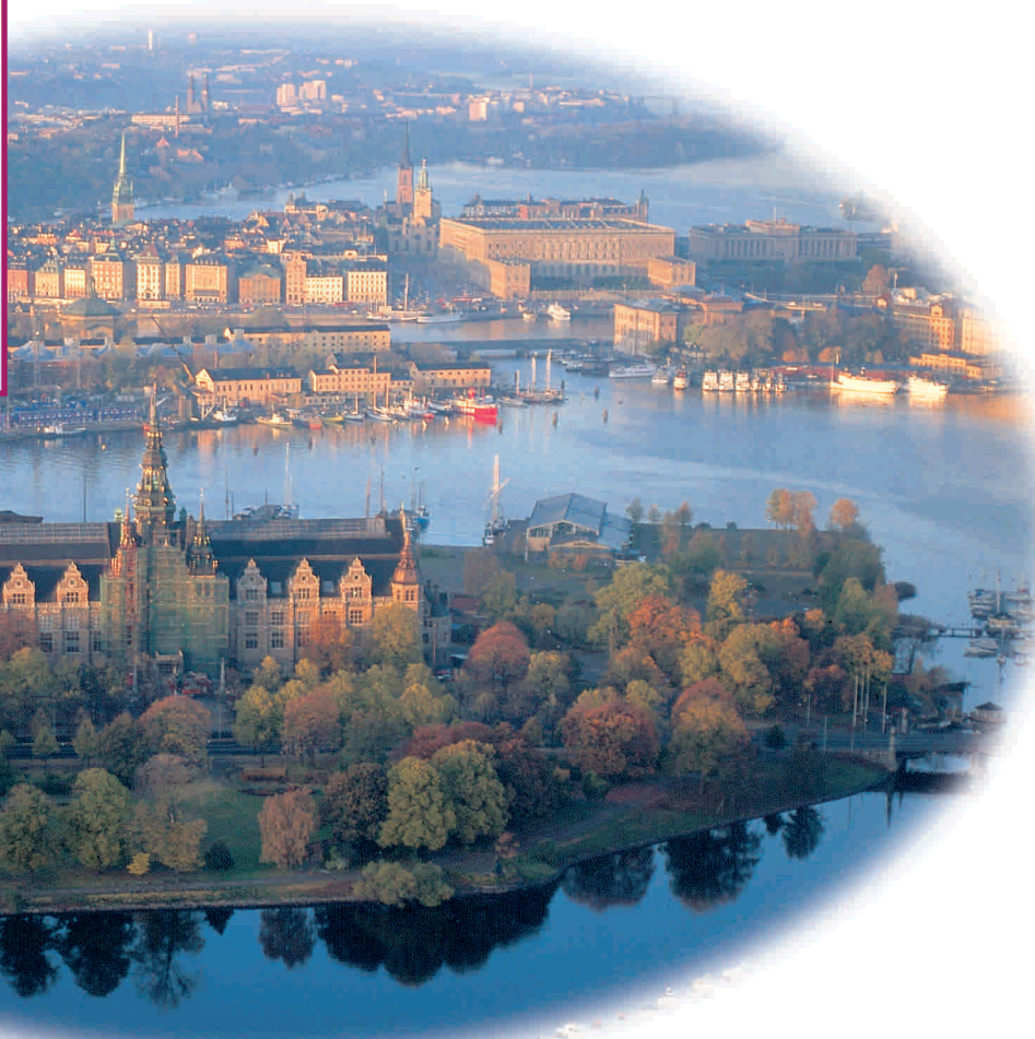
Stockholm.